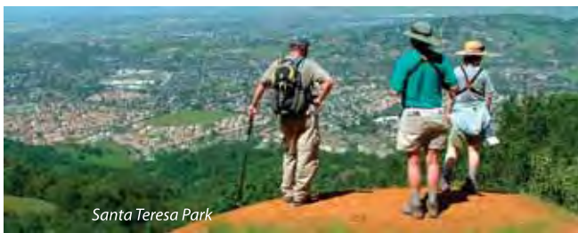
Santa Teresa Park