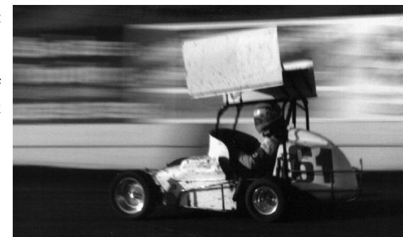
A Micro Midget speeds down the back stretch on the Metcalf Raceway Park clay oval, 1986.

Metcalf Motorcycle County Park may be home to several species of endangered plant and animal species including the California red-legged frog, Bay checkerspot butterfly, Metcalf Canyon jewel flower, Santa Clara dudleya, and Mt. Hamilton thistle. Most of the endangered plant species are found in the serpentine soil habitats. Locations of these habitats have been identified and the Parks Department is committed to preserving these areas by restricting new trail development. Additionally, the department has closed some trails for habitat rehabilitation and continues an ongoing erosion and sedimentation control program to protect the watershed and preserve the landscape.