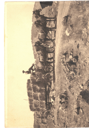
Hay bale transport in the Santa Teresa Hills.